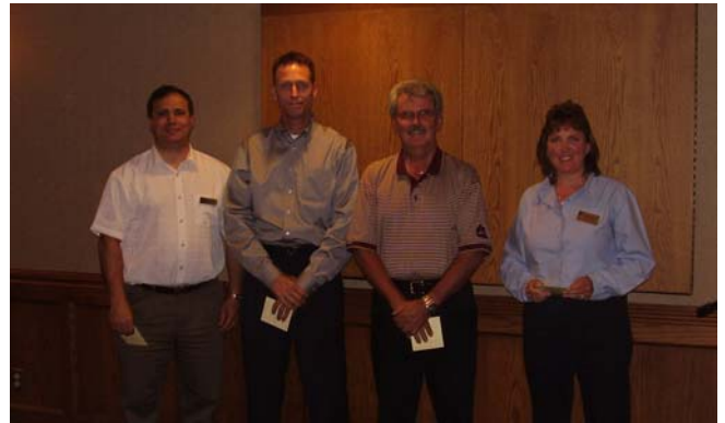
Silver Award Winners

Bronze, Silver, Gold, and Platinum Awards were presented.