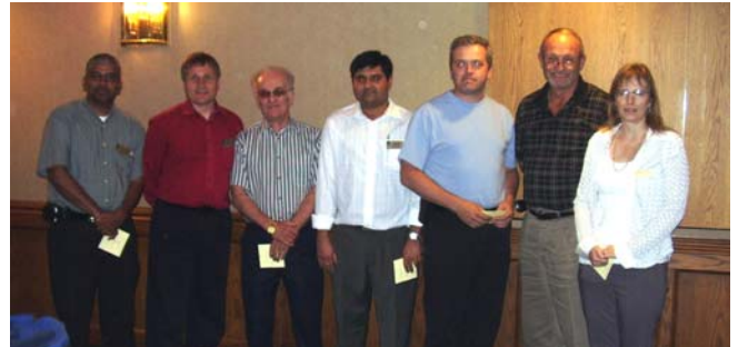
Gold Award Winners