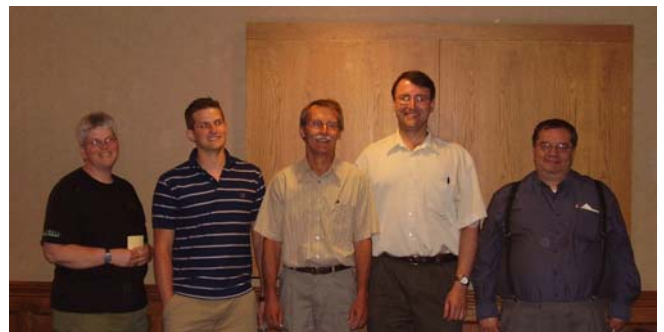
Platinum Award Winners

Congratulations to all award recipients.